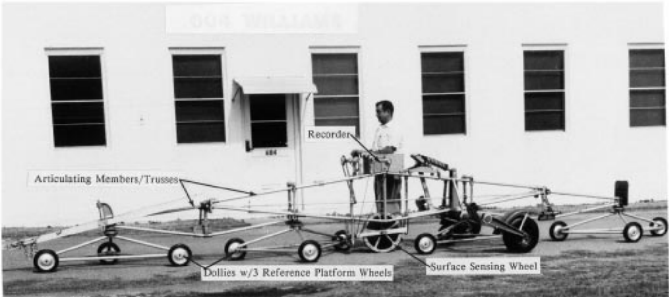
FIG. 1 Typical Profilograph