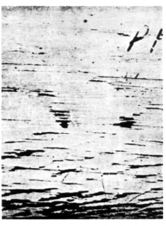
FIG. 1 Degrees of Flaking (Scaling)