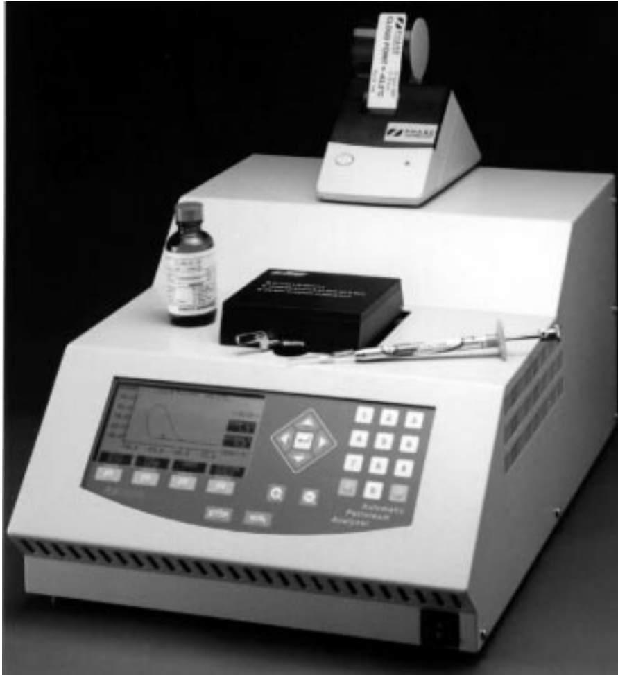
FIG. A1.3 Apparatus Exterior

The American Society for Testing and Materials takes no position respecting the validity of any patent rights asserted in connection with any item mentioned in this standard. Users of this standard are expressly advised that determination of the validity of any such patent rights, and the risk of infringement of such rights, are entirely their own responsibility.