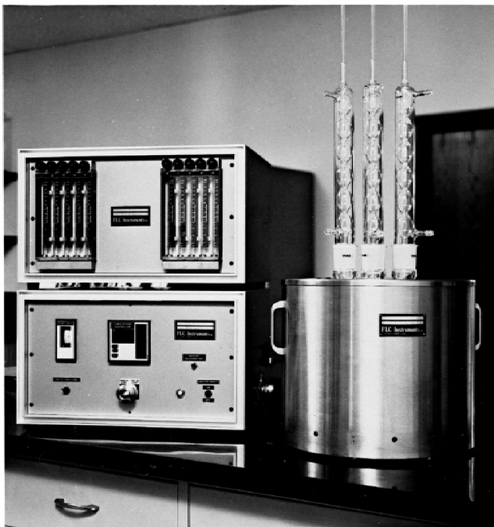
FIG. 1 Heating Block

6.1.2 Holes in the aluminum block to accommodate the test cells shall provide 1.0 mm maximum clearance for 38-mm