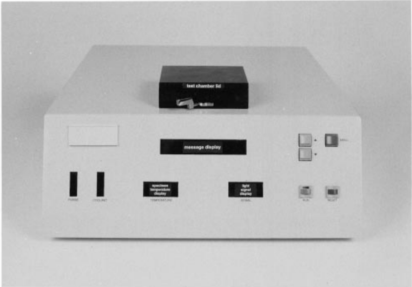
FIG. A1.3 Apparatus Exterior

ASTM International takes no position respecting the validity of any patent rights asserted in connection with any item mentioned in this standard. Users of this standard are expressly advised that determination of the validity of any such patent rights, and the risk of infringement of such rights, are entirely their own responsibility.