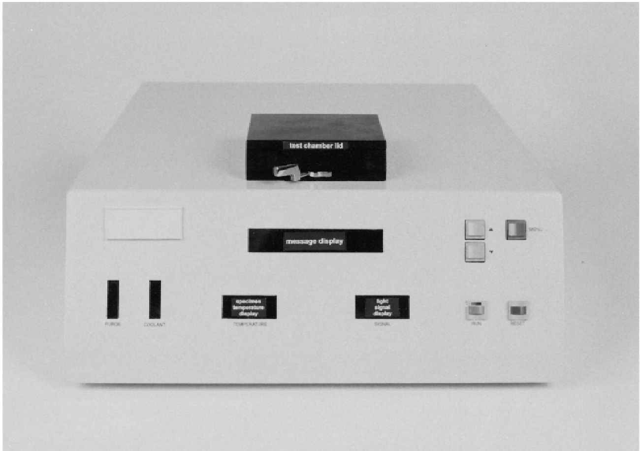
FIG. A1.3 Apparatus Exterior

A1.1.6 Apparatus Exterior Interface , the exact layout of controls and display may vary; however, a typical apparatus is shown in Fig. A1.3.