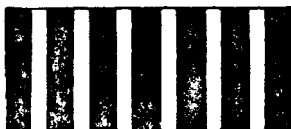
FIG. 3 Stroboscopic Lines Opening When Timer is Adjusted to Exactly 200 r/min