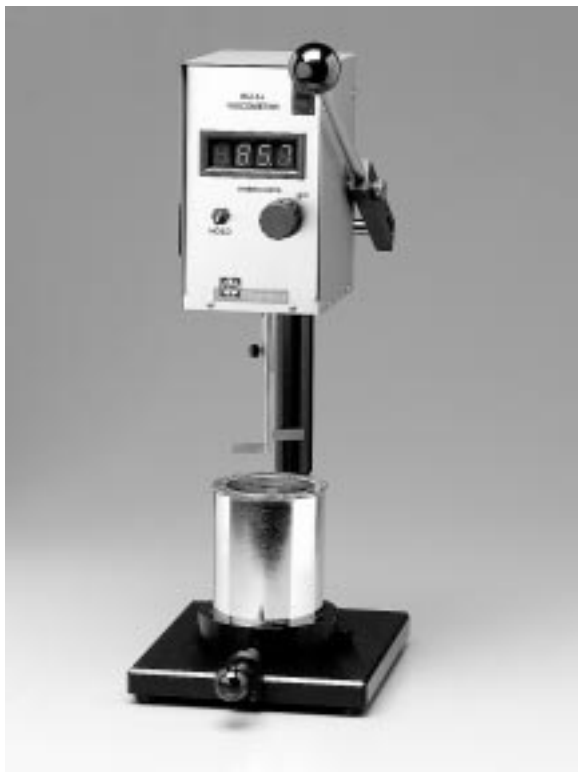
FIG. 5 Digital Stormer-Type Viscometer

16.3 Adjust the temperature of the standard oils to 25 \pm 0.2^\circ\text{C} . The temperature of the viscometer should be the same. If the specified temperature cannot be obtained, record the