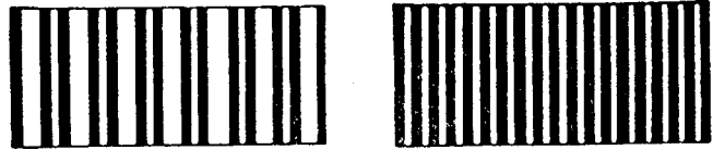
FIG. 4 Stroboscopic Lines Appearing as Multiples that May be Observed Before 200-r/min Reached

12.1.1 The load in grams to produce 200 r/min (100 revolutions in 30 s),