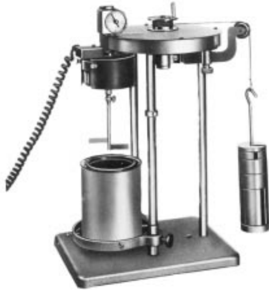
FIG. 1 Stormer Viscometer with Paddle-Type Rotor and Stroboscopic Timer