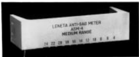
FIG. 2 Medium Range Anti-Sag Meter

methods, for example Test Methods D 2196, are time-consuming and lack the convincing aspect of actual sagging. This method provides simple and rapid tests, whereby sag resistance is demonstrated by a visible sag pattern, and is rated objectively in terms of numerical values that correlate with brushout test observations.