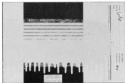
FIG. 3 Typical Sag Pattern

A Mils are exact. Wet film thickness is about half of clearance.