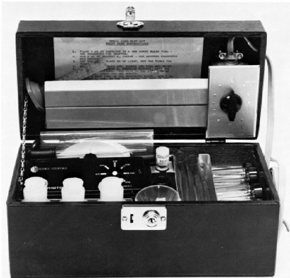
FIG. 1 Mobil Lead Test Kit

6.4 Test Tubes , 7,8 borosilicate, 18 by 150 mm.