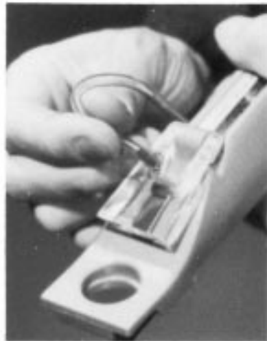
FIG. 2 Cleaning

NOTE 4—Oil contamination will reduce the sharpness of the dividing line.