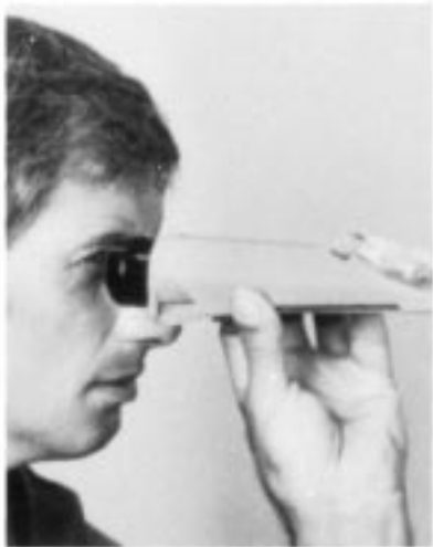
FIG. 4 Reading

9.1.1 For different test operators using the specified equipment and the procedure in Section 8, the results should not vary more than 0.5°C (1.0°F) when the temperature of the coolant solution is 24°C (75°F) or more than 1°C (2°F) from the average value when the coolant solution temperature is 82°C (180°F).