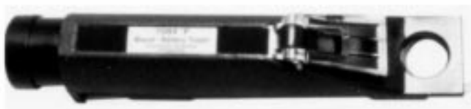
FIG. 1 Hand-Held Critical Angle Refractometer