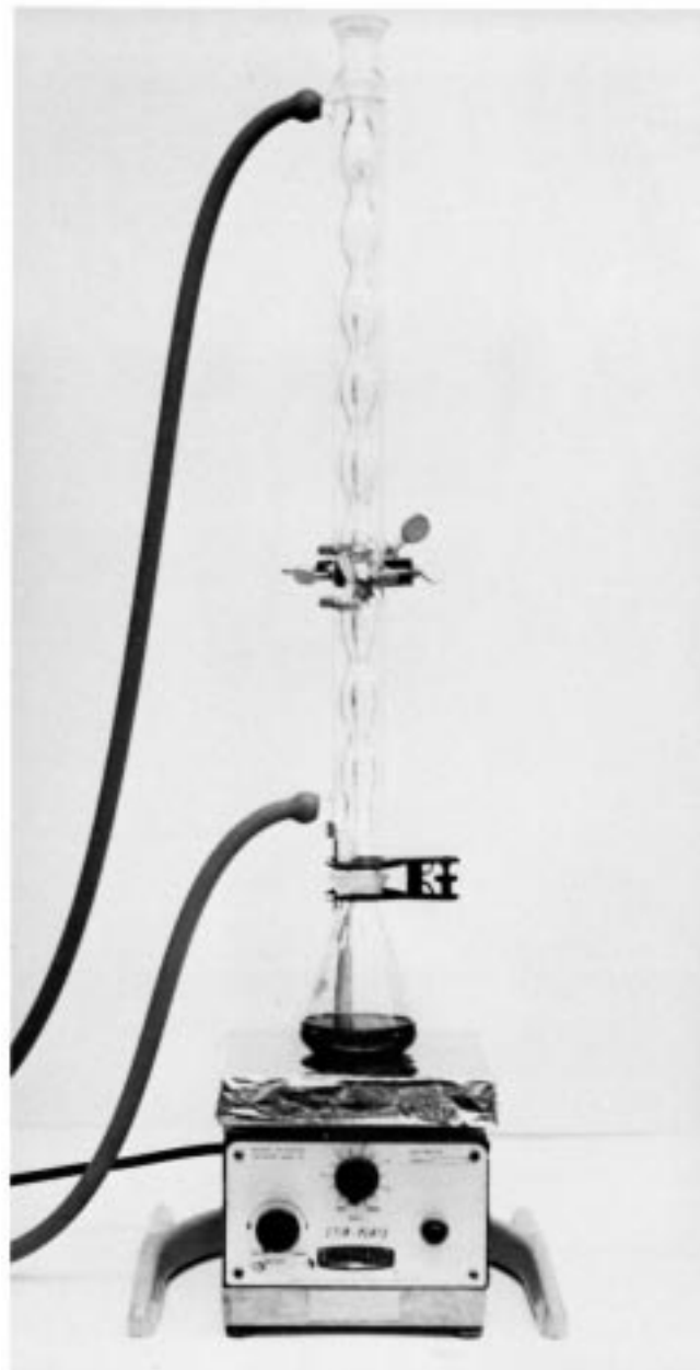
FIG. 1 Dispersing Apparatus