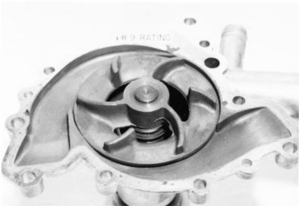
FIG. X1.4 Rating 9