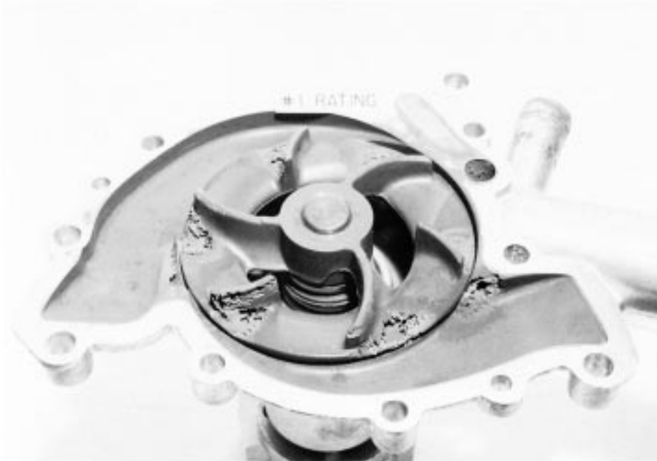
FIG. X1.1 Rating 1