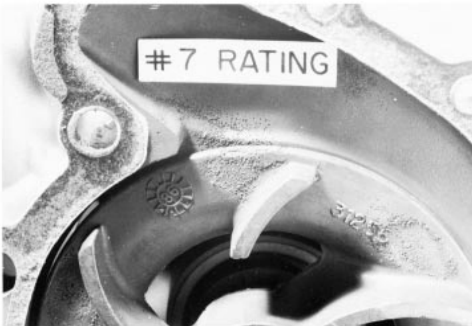
FIG. X1.2 Rating 7