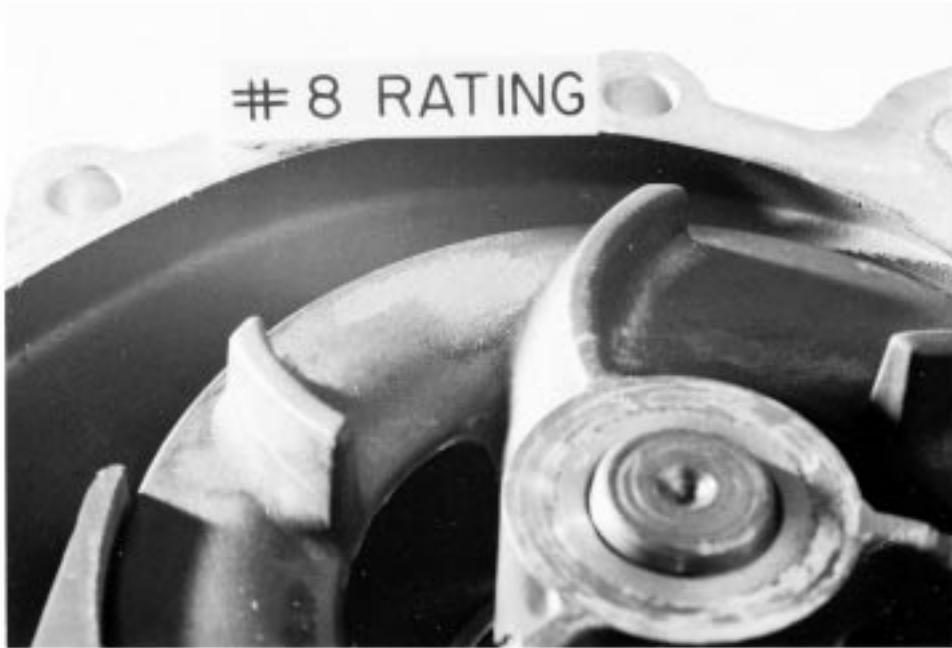
FIG. X1.3 Rating 8