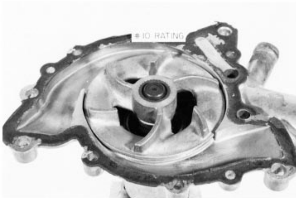
FIG. X1.5 Rating 10

The American Society for Testing and Materials takes no position respecting the validity of any patent rights asserted in connection with any item mentioned in this standard. Users of this standard are expressly advised that determination of the validity of any such patent rights, and the risk of infringement of such rights, are entirely their own responsibility.